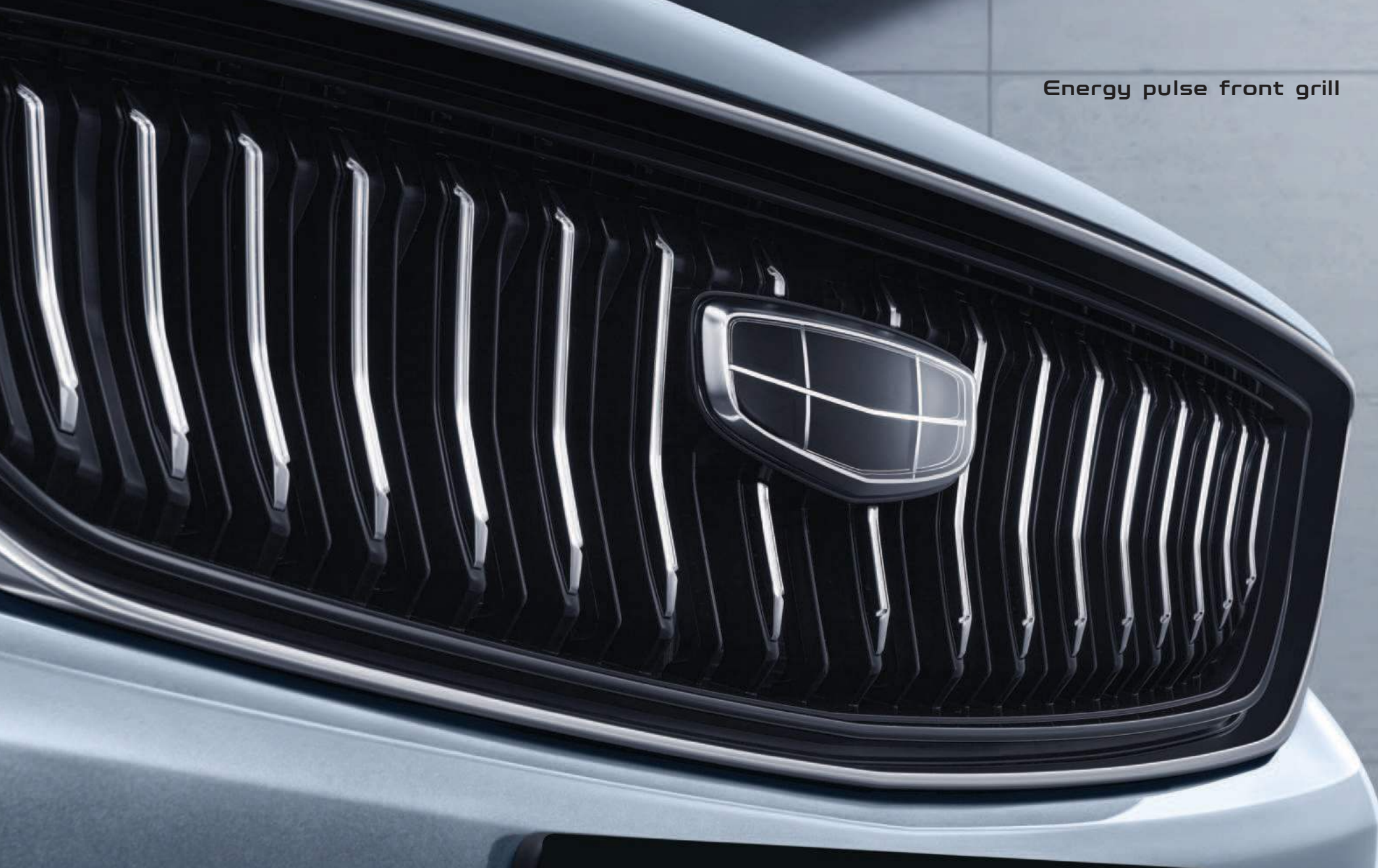
Energy pulse front grill