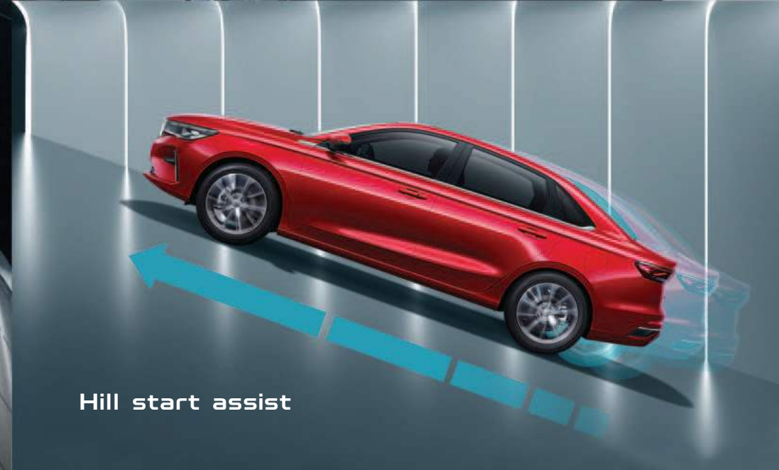
Hill start assist