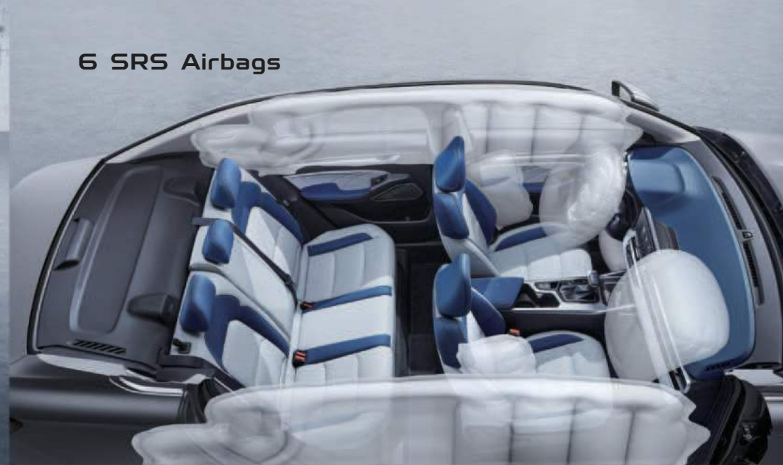
6 SRS Airbags