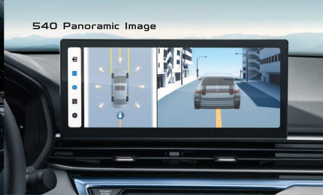
540 Panoramic Image