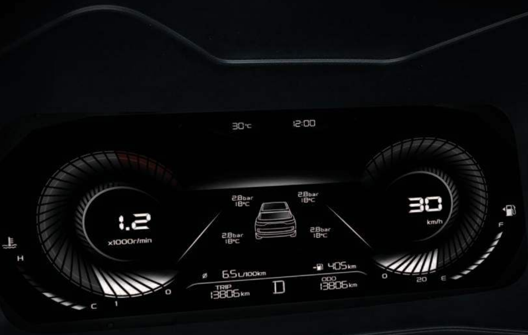
12.3" HD digital instruments