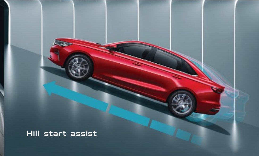
Hill start assist