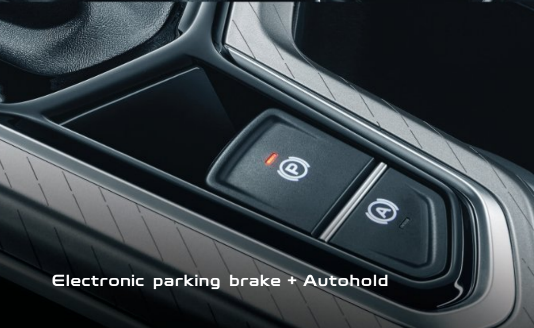
Electronic parking brake + Autohold