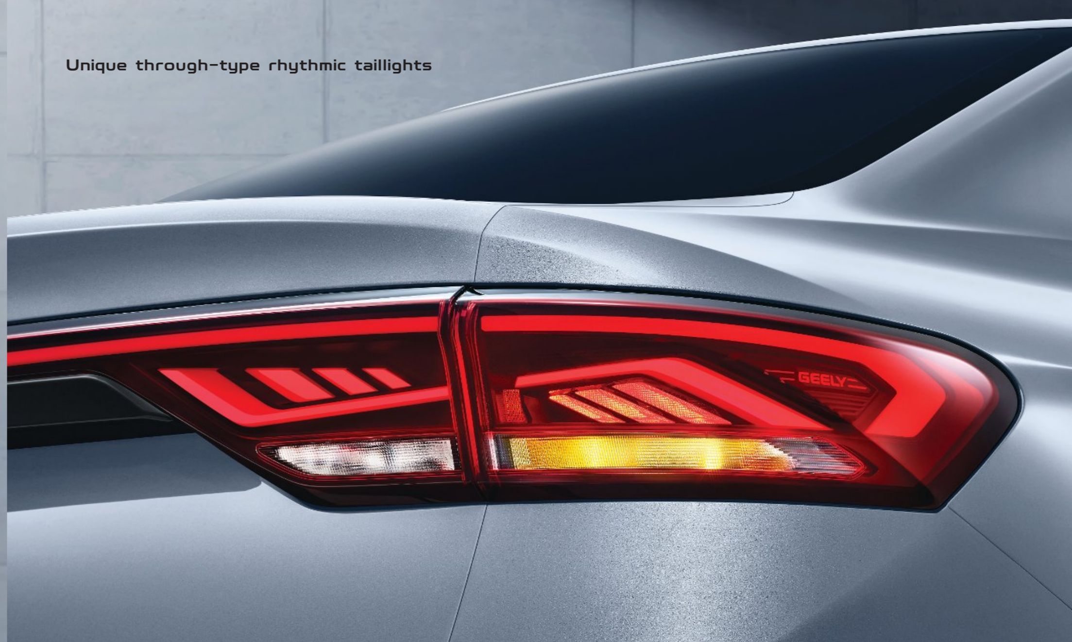
Unique through-type rhythmic taillights