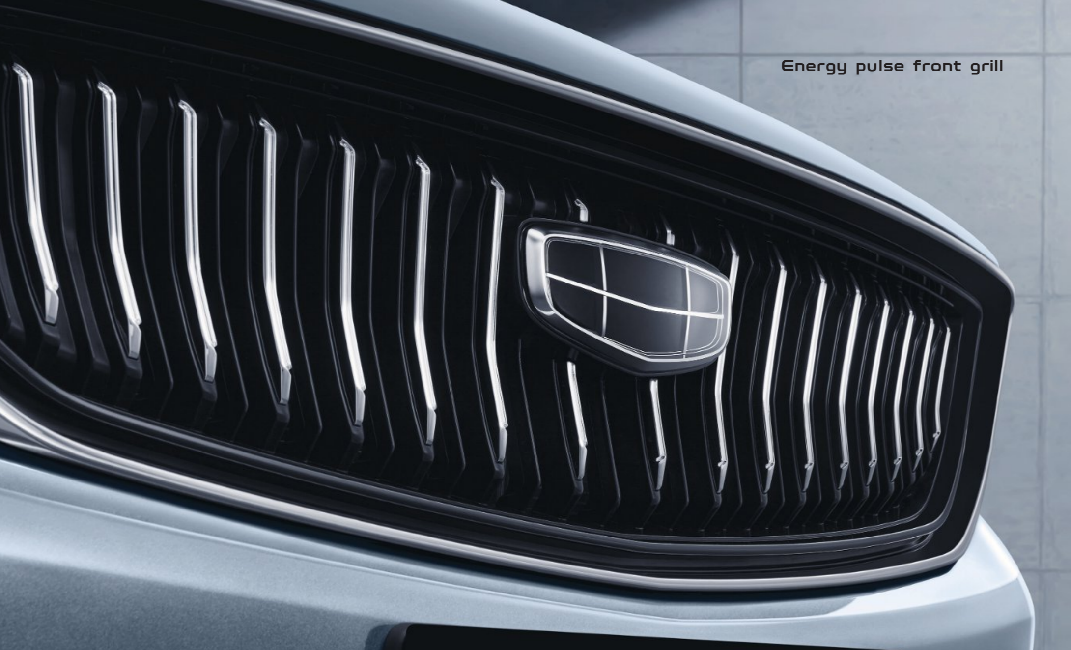
Energy pulse front grill