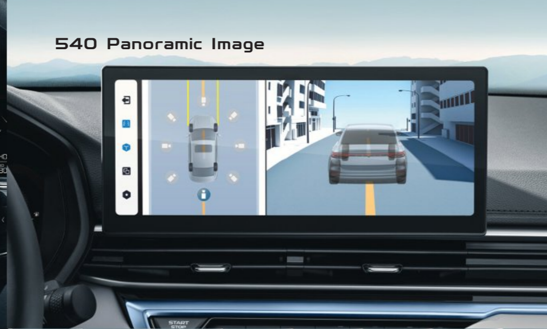
540 Panoramic Image