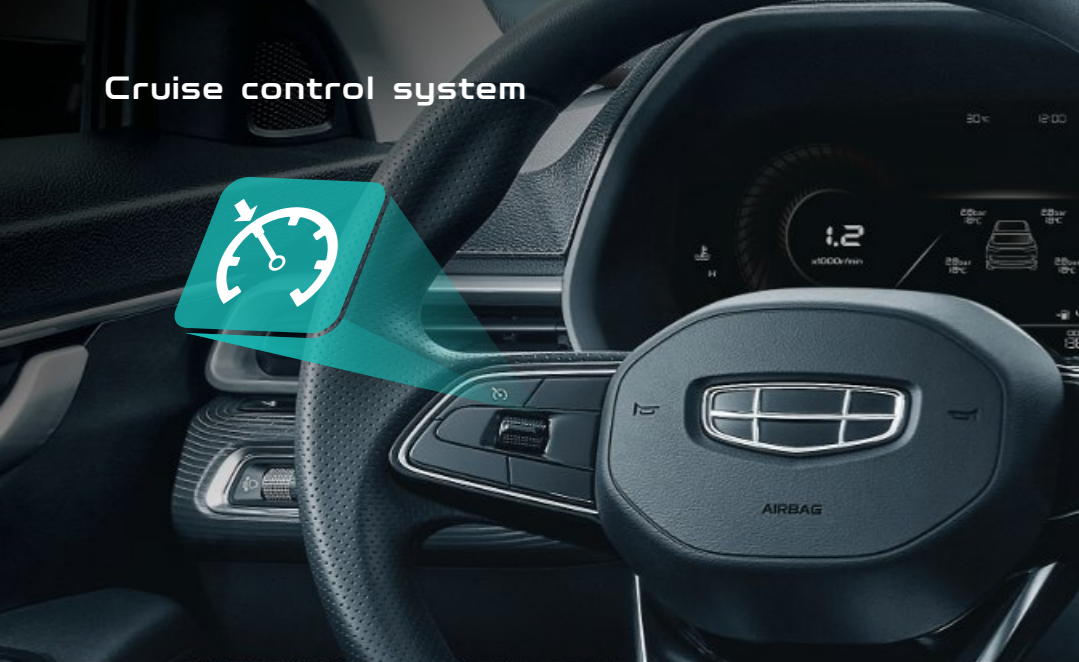
Cruise control system