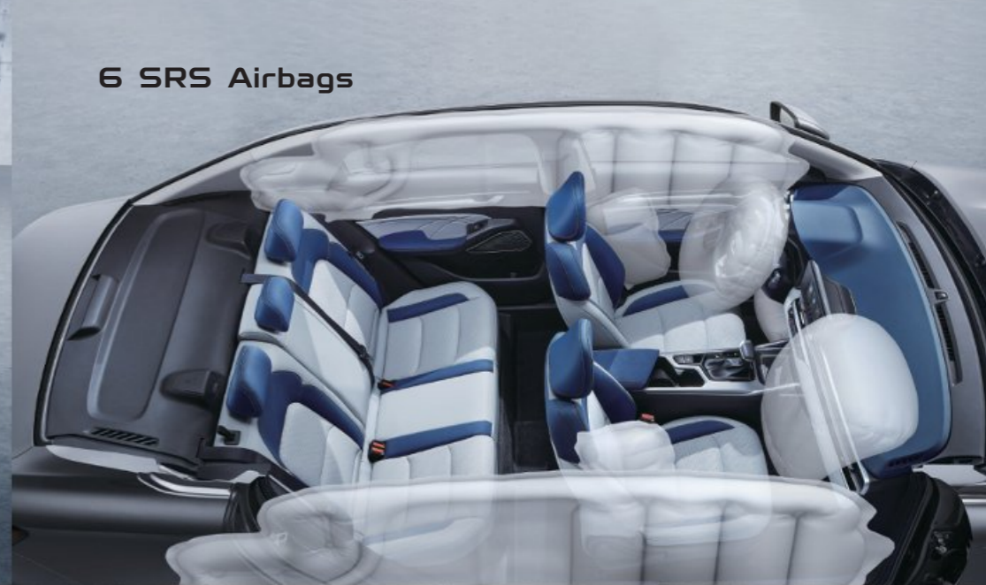
6 SRS Airbags