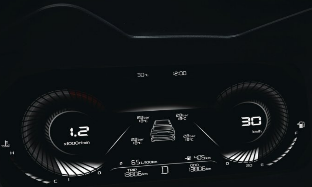
12.3" HD digital instruments