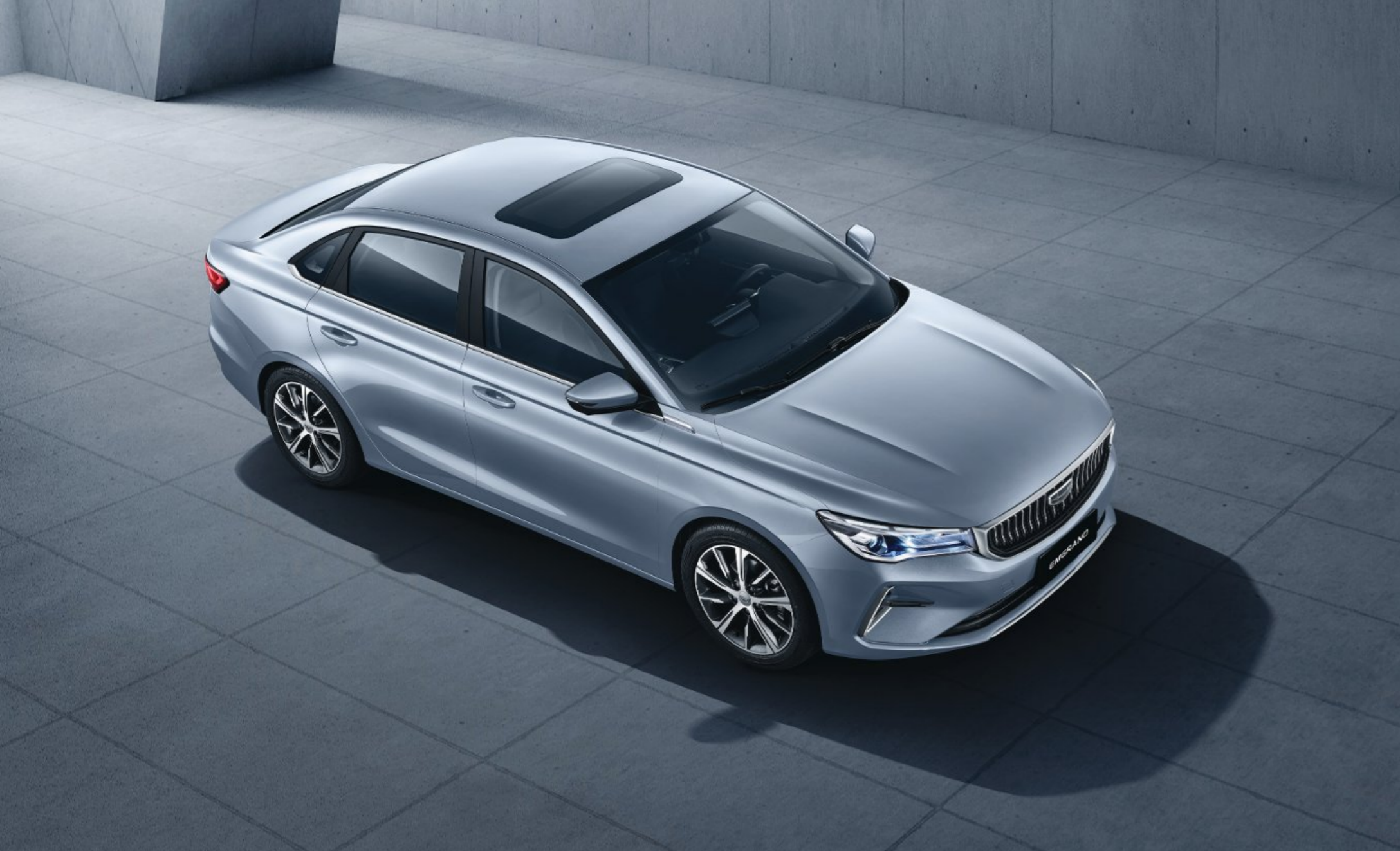
Smooth and fuel efficient 1.5L 4-cylinder D-CVVT engine