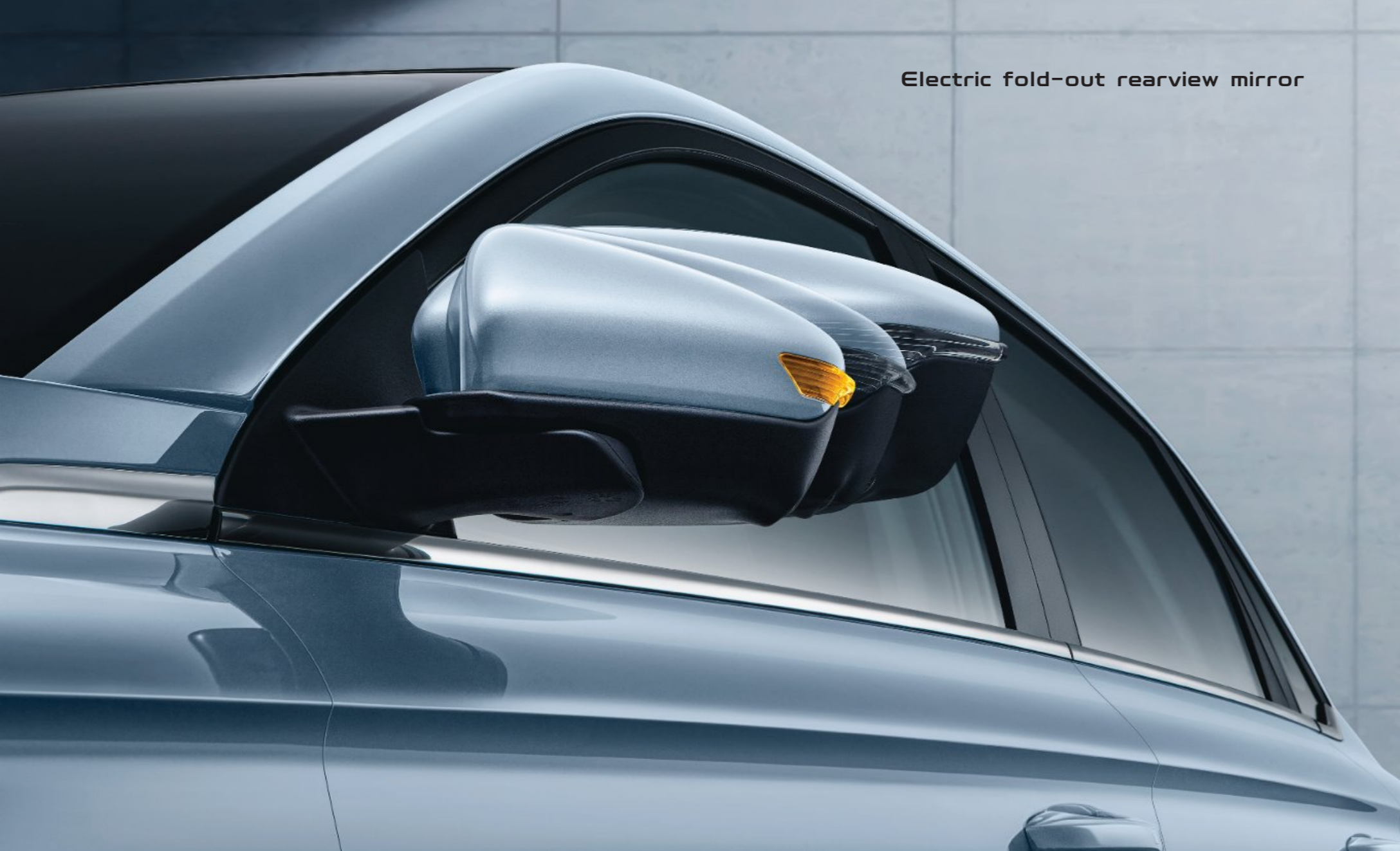
Electric fold-out rearview mirror